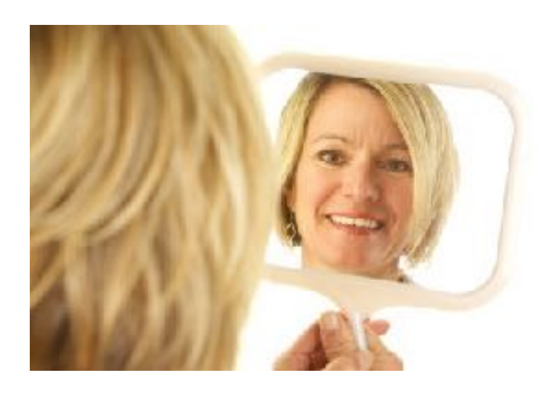
"I love you. I really, really love you."